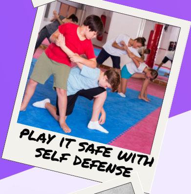
PLAY IT SAFE WITH SELF DEFENSE