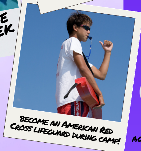
BECOME AN AMERICAN RED CROSS LIFEGUARD DURING CAMP!