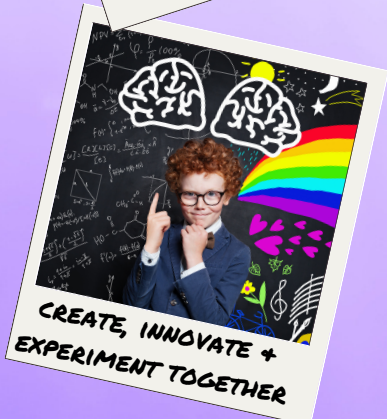
CREATE, INNOVATE + EXPERIMENT TOGETHER