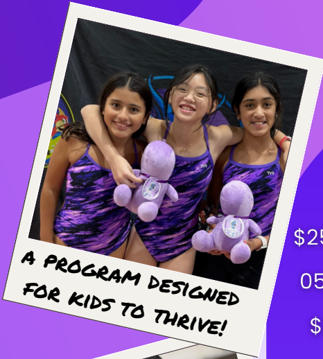
A PROGRAM DESIGNED FOR KIDS TO THRIVE!