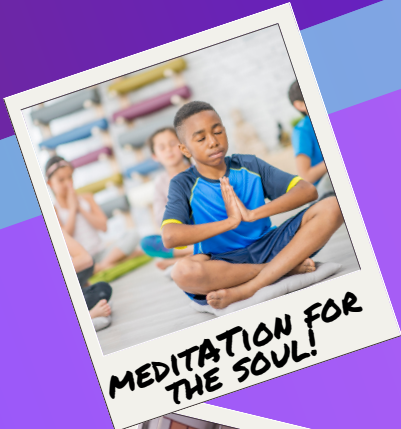
MEDITATION FOR THE SOUL!