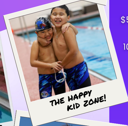
THE HAPPY KID ZONE!