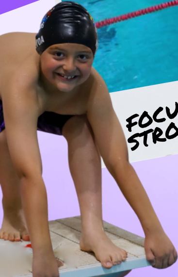
FOCUSING ON ONE STROKE PER WEEK